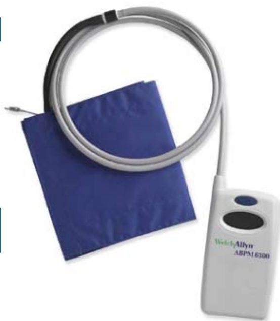
▲ Blood pressure cuff

You should wear loose fitting clothes, especially around the upper arm. You are not required to undress fully. If possible, please wear a blouse or shirt which buttons at the front - this allows easier fitting of the equipment.