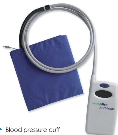
▶ Blood pressure cuff